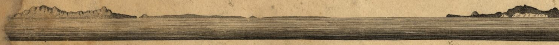
Appearance of the Rock of Lisbon and the High Land over Cape Espichel, Cape Rosset bearing N. N. E. E. by Compass dist 6 or 9 Leagues, S. Cape Espichel E. by S. 4 or 5 Leagues.