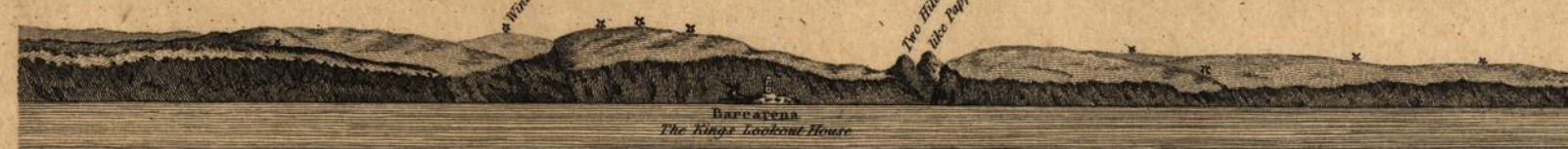
The general appearance of the High Land, the upper part of which forms the Horizon, when in the Fair-way of the South Channel, with the Marks to avoid the Catchops, in turning between them.