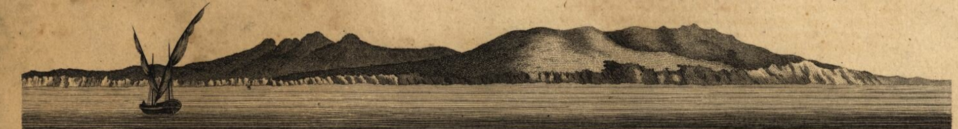
The Rock of Lisbon, Eastward 2 Leagues distant.