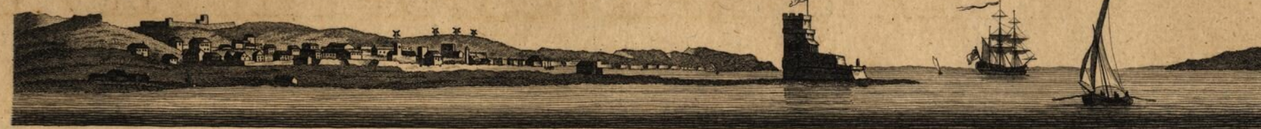
View of Belem Tower and Castle on the River Tagus.