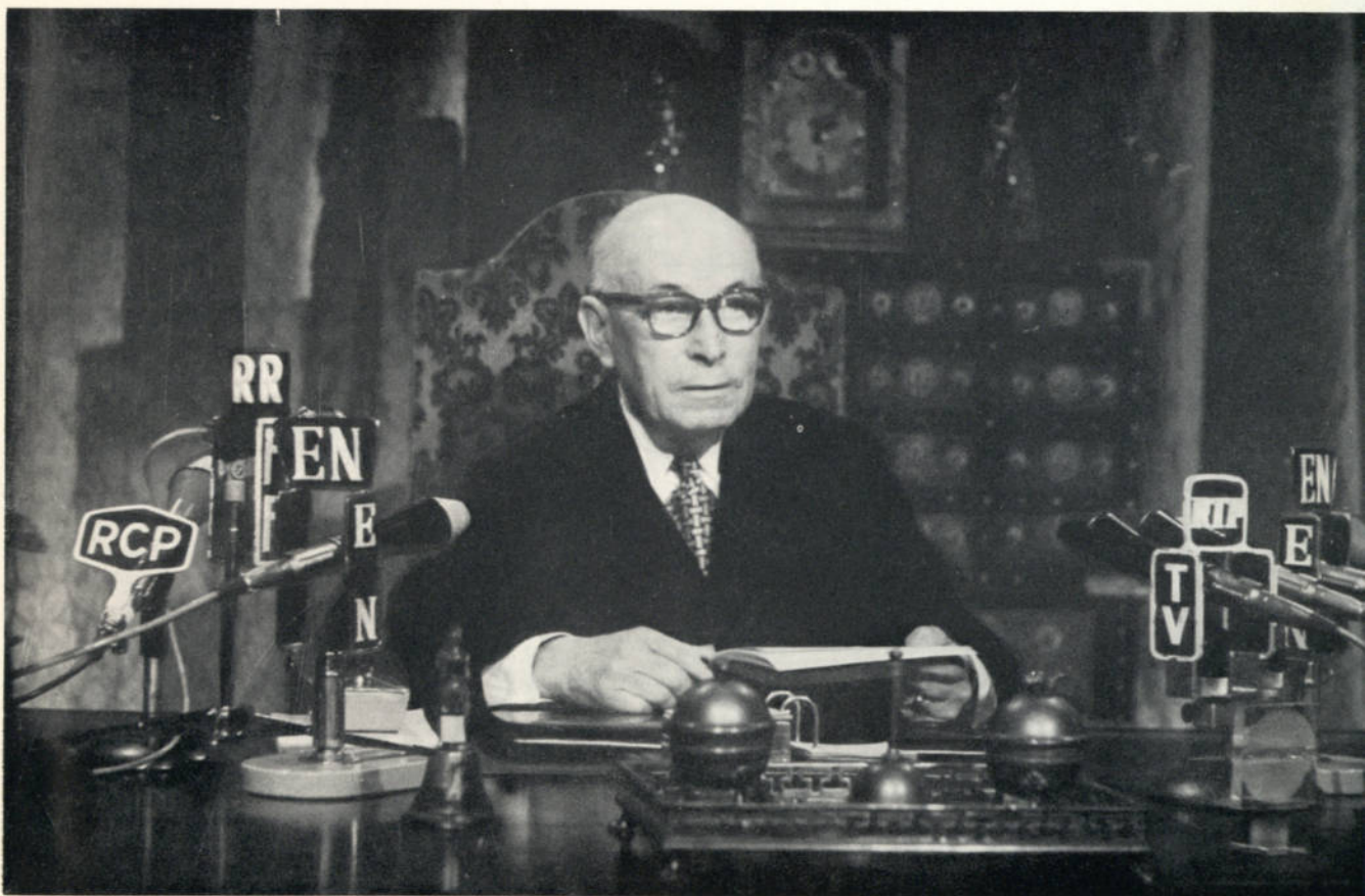
THE PRESIDENT, READING HIS NEW YEAR MESSAGE AT THE MICROPHONES OF THE PORTUGUESE RADIO AND T. V. NETWORKS.