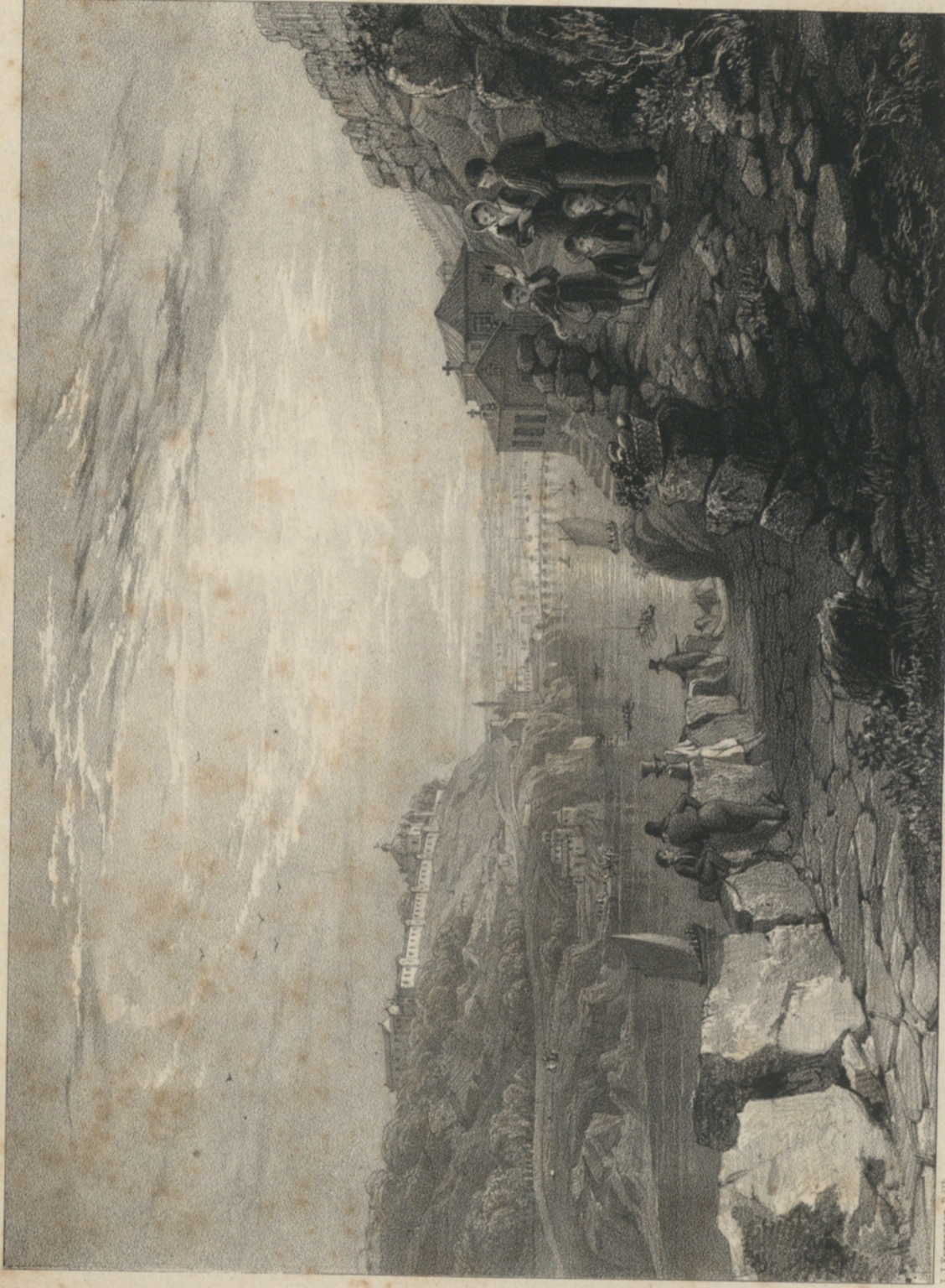
CONVENTO da SERRA. PORTO.